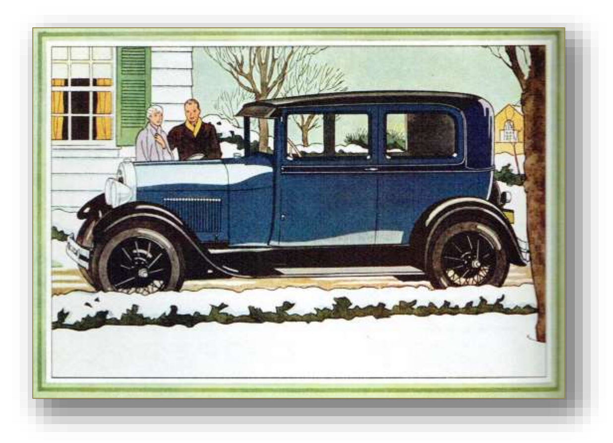
"Look what Santa brought for the New Year!"